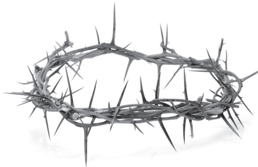
Crown woven out of thorns. The Romans were accustomed to making laurel crowns for their heroes, both military and sporting.

But what of the curse pronounced because of man's sin? This penalty ending in death still had to be paid if