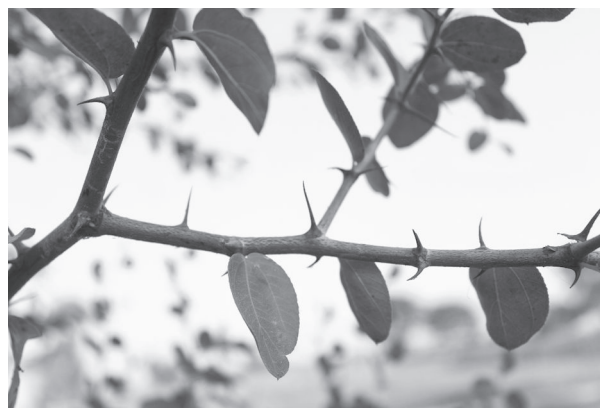
Ziziphus spina-christi, also known as the Christ's thorn jujube, is native to the Levant and Mesopotamia. Arguments abound as to whether or not the crown of thorns was formed from this tree. Other prickly possibilities include a Middle Eastern relative of the British native blackthorn (sloe).

Proverbs 24:30-31 shows us a literal image that is also meant figuratively: "I went by the field of the lazy man, and by the vineyard of the man devoid of understanding; and there it was, all overgrown with thorns; its surface was covered with nettles; its stone wall was broken down." If