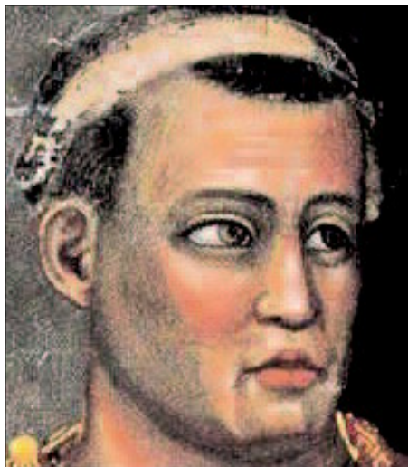
Pontius Pilate asked Jesus, 'What is truth?' (Painting by Giotto, 1305)

Another apostle helps to clarify. John explains that the Holy Spirit is the spirit of truth that 'the world cannot receive' (John 14:17). Our Creator must first call us and supernaturally open our minds to understand His truth. There is no other way in which we can comprehend it. It is revealed to 'as many as the