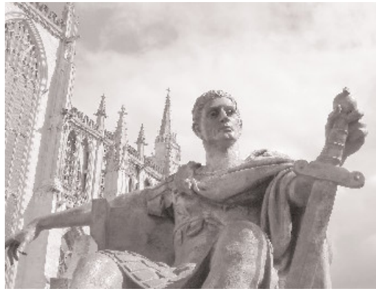
The Emperor Constantine

Over the centuries there has been a virtual explosion of contradictory practices and conflicting factions in the Christian world. Over time a counterfeit Christianity has arisen. In the first century Jesus Christ and the apostles predicted that false ministers and false brethren would emerge, and indeed had already begun to appear in the apostles' time. After about 400 years, by the time of the Emperor Constantine, much of Christ's original gospel was hardly recognisable.