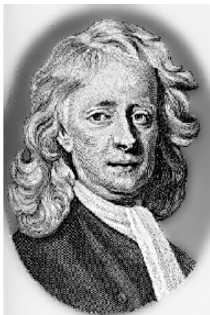
Sir Isaac Newton

What we know as the 'New Testament' was only completed a few decades after all but one of the original apostles had been killed. John was the