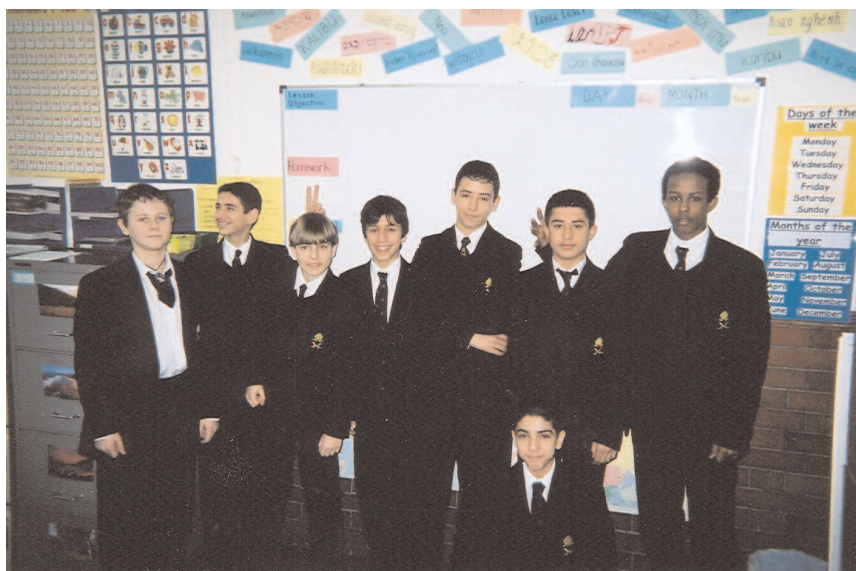
Students from Afghanistan, Algeria, Brazil, Iran, Iraq, Lithuania, and Somalia.

spent a year in Sierra Leone working with children of war. I asked him where one can start to educate these young people? He gave me four basic principles that prompted me to think about what I do in my role as a teacher today, and what true Christians will all do as teachers in Christ's millennial reign. I like to think of this as the S-T-E-P programme.