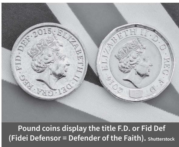
Pound coins display the title F.D. or Fid Def (Fidei Defensor = Defender of the Faith).