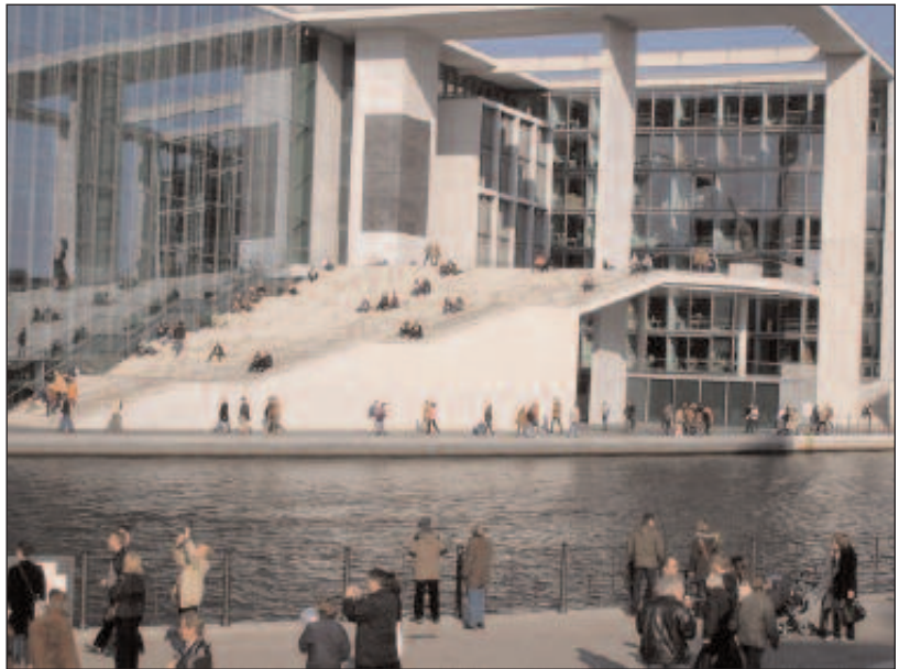
National Library in Berlin