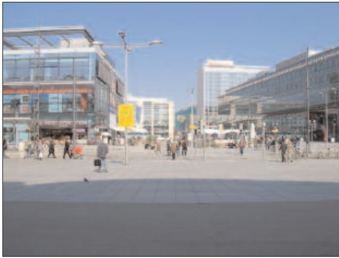
Dresden Shopping Precinct

There is, however, apprehension among some EU countries that Germany will dominate the EU more and more in future years. Being the most economically sound economy on the European Continent, and exporting more to other nations than any other EU country, Germany could easily play a dominating role in the European Union. Not everyone would welcome that. When Germany was reunited, the then British Prime Minister Margaret Thatcher publicly congratulated the German Chancellor Helmut Kohl, but whether she fully welcomed reunification, seeing that it would add economic