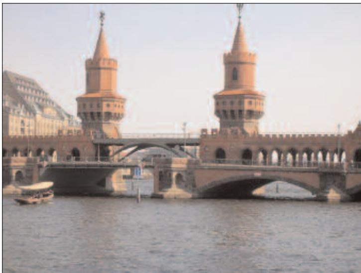
The spectacular Oberbaum Bridge spans the river Spree, linking Kreuzberg, formerly in West Berlin, and Friedrichshain, formerly in East Berlin.

Visitors to Germany like much of what they see in the unified country. It is democratically run like any western democracy. It’s economically sound, even though it has a high percentage of unemployment – although that figure is decreasing steadily. The people are very