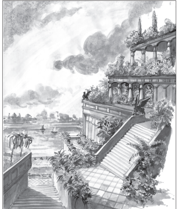
Artist's impression of the Hanging Gardens of Babylon, attributed to Nebuchadnezzar II.

Throughout the Bible, the Almighty has promised a glorious outcome to those who obey His word. Daniel was