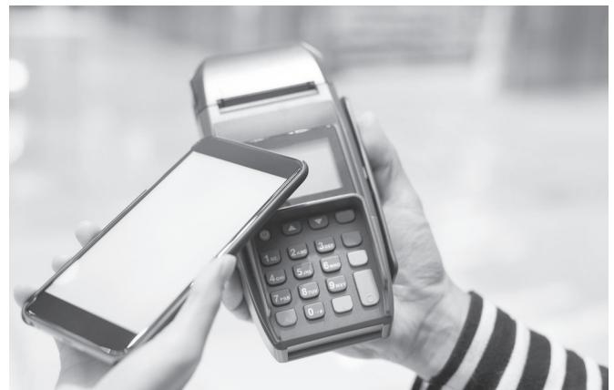
Many already make purchases using phones and cards in preference to coins and notes.

The desire for a cashless society has several drivers, including the ability to control money and avoid its accumulation in areas currently inaccessible to governments.